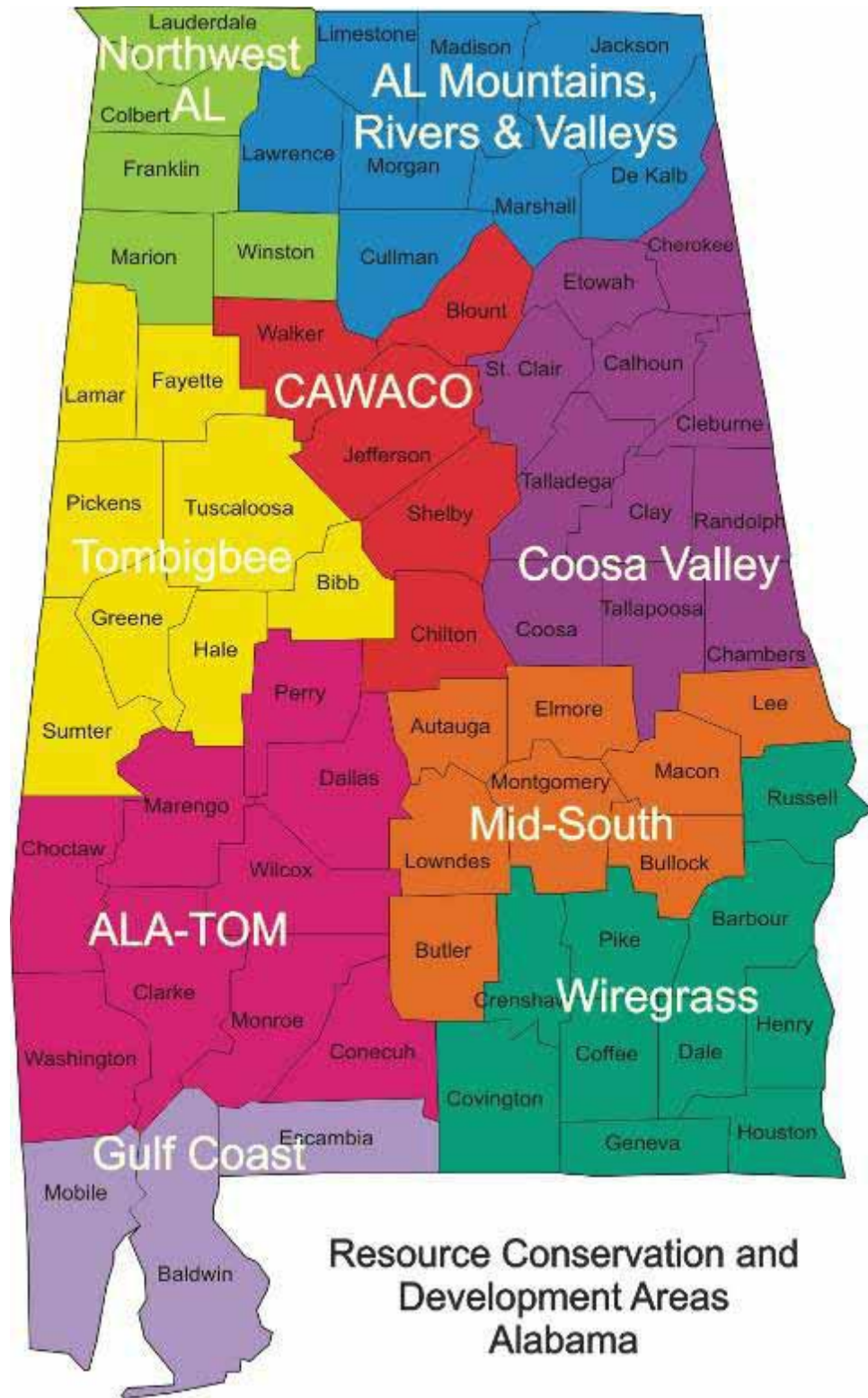
Resource Conservation and Development Areas Alabama