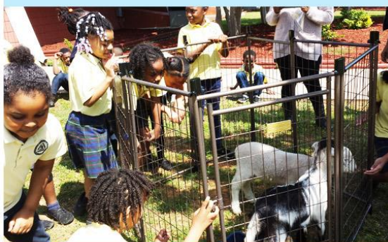
Above: Students learn about livestock and farm animals at the Madison Urban Youth Farm Day.

By using our human resources and bringing people together for a shared goal, we can achieve anything. This year the AMRV RC&D contributed over $70,000 directly to local schools and $163,500 to education initiatives.