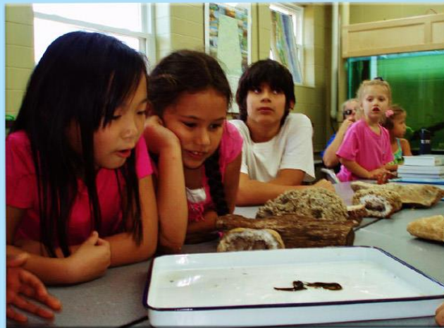
Above: Students get up close and personal with some marine invertebrates! Below, Left: Children experiencing the interactive water treatment wetlands exhibit.

Jay Grantland jay.grantland@amrvrcd.com (256) 773-8495