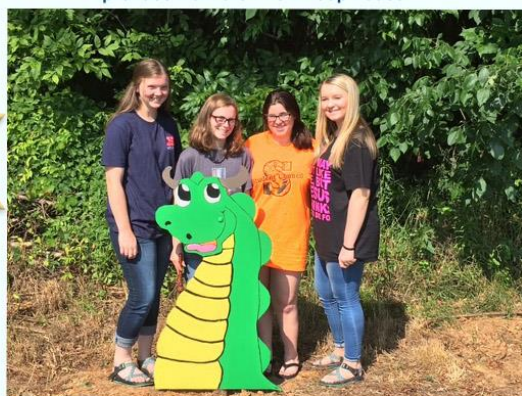
Above: Students pose in front of their new trail sculpture.