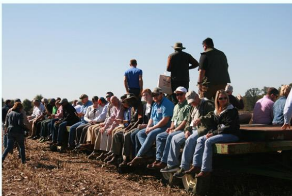
Above: Our partners at the Soil and Water Conservation District had a great turn out for the Madison County Farm Ag Tour.

With the help of our amazing partners and volunteers, we have accomplished incredible things. Over 660 volunteers donated their time to make these projects happen in their communities