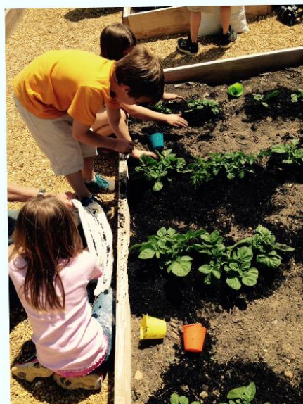
Above: Students at Brindlee Mountain get their hands dirty in their new raised bed gardens.